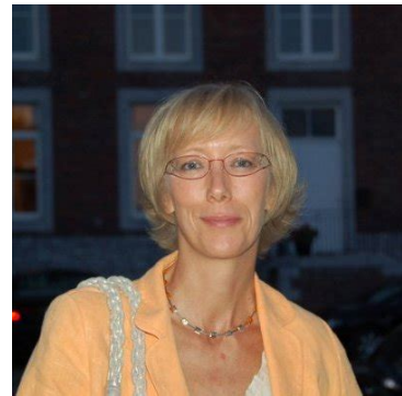
Figure 7.1: Computer scientist Marianne Baudinet’s (1985) work with David MacQueen on compiling ML-style pattern matching constructs to efficient matching code proved to be the breakthrough that made the extensive use of pattern matching in ML-style languages practical.